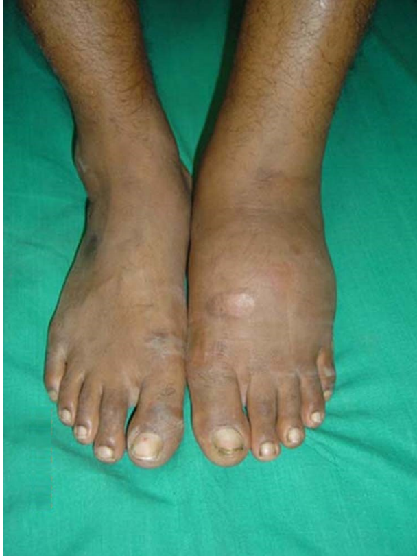
Typical Charcot foot presentation, with diffuse and nonpainful swelling in the left foot.