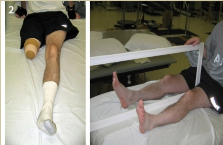
Using a mirror, the brain is “tricked” into seeing two limbs.