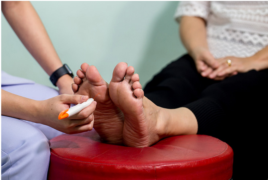
Clinician examining nerve response with a monofilament instrument.

The Semmes-Weinstein monofilament test is one of the easiest methods for evaluating loss of sensation in patients with diabetic peripheral neuropathy. The testing instrument is made up of a set of monofilaments ranging in thickness and diameter. It is recommended to obtain the monofilaments from suppliers who sell calibrated instruments, since research has found significant variability among different brands of monofilaments. Some brands of monofilaments will bend at 8 g of force instead of at the 10 g of force for which they intended (Baranoski & Ayello, 2020).