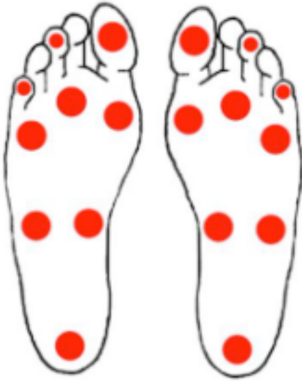
Monofilament testing sites on the bottom of the foot.