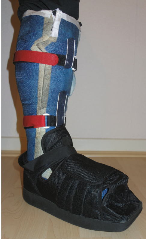
Total contact cast.