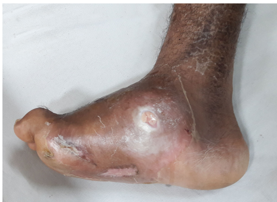
Charcot foot deformity with an ulcerated abscess.

Charcot foot can lead to severe deformities that not only alter the patient’s gait but also create areas of high pressure on the surface of the foot, prompting the development of a diabetic foot ulcer. During examination of the patient’s foot, the clinician looks for significant deformity signifying collapse of the structures of the mid-foot and the development of rocker-bottom foot (WOCN, 2022).