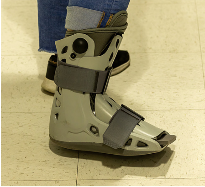
Pneumatic walking brace/boot.