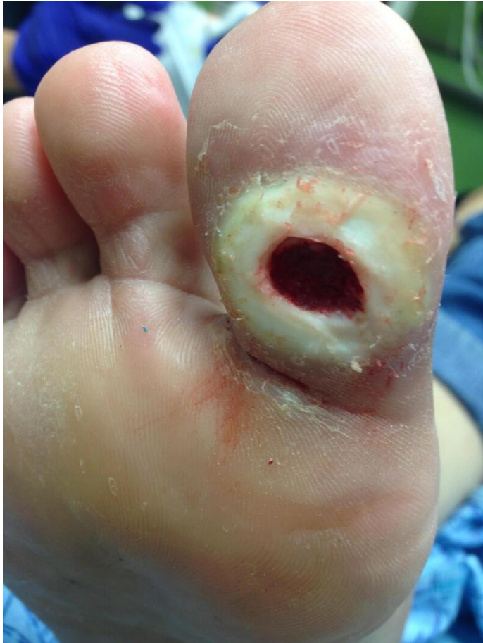
Diabetic foot ulcer with periwound callous formation.